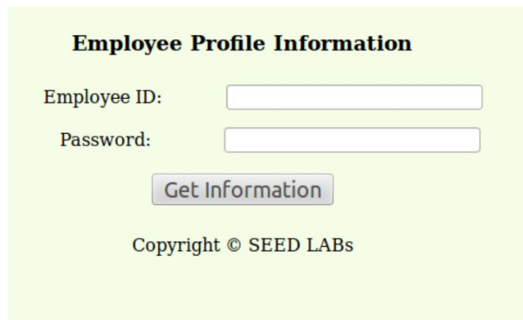
Figure 1: The Login Page

The browser starts at the entrance page of our web application at www.SEEDLabSQLInjection.com , where you will be asked to provide Employee ID and Password to log in. The login page is shown in Figure 1. The authentication is based on Employee ID and Password, so only employees who know their IDs and passwords are allowed to view/update their profile information. Your job, as an attacker, is to log into the application without knowing any employee's credential.